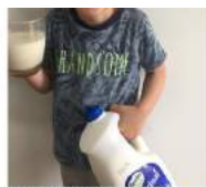
Our dairy just does the milk!

In fact, it's something above it's weight when it comes to protein, it has 25% more protein on average than the minimum standard required. It's always looking for ways to increase the protein in my families diet, so this is a real bonus. One like that makes it a great for fluffy and coffee with a silky consistency and what's more, it's refreshing to have a local company listen to consumers. And despite the lengths they've gone to to make this milk taste and perform better, it costs the same. Chew's Meadow Fresh, it's great to be heard!